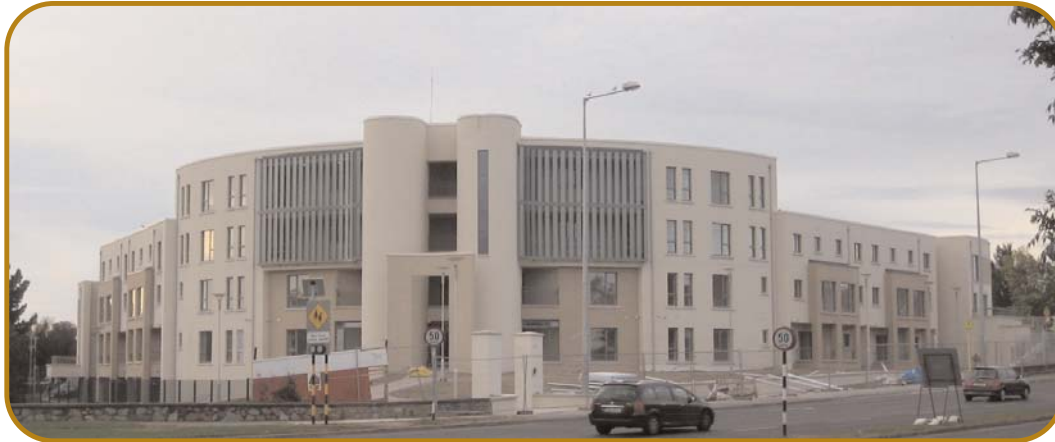
Completed Co-operative Housing Project Riverside, Loughlinstown Drive, Site provided by Dun Laoghaire Rathdown County Council